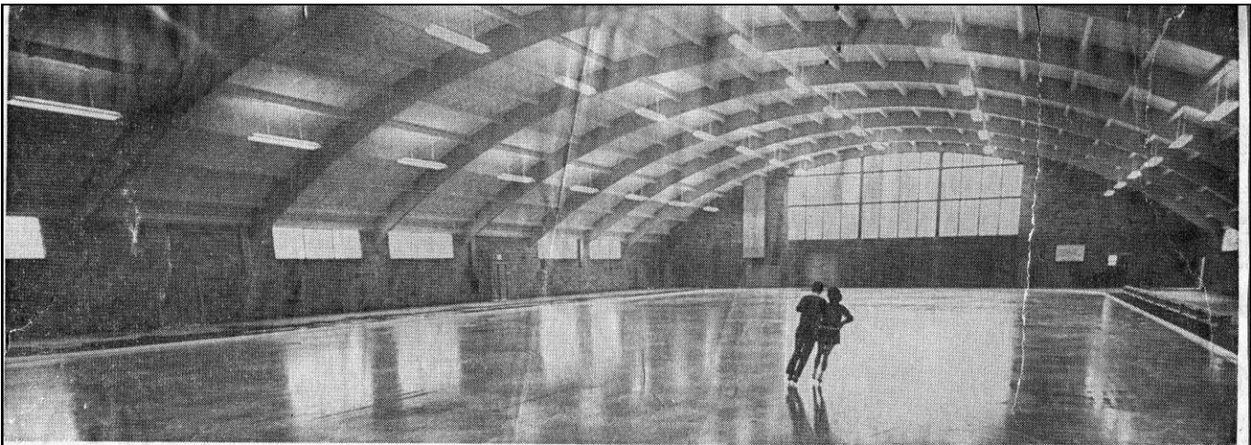
ROOM AT THE RINK—A couple glides over ice at Wilmington Skating Club's new $450,000 indoor